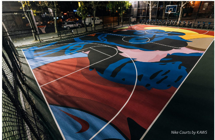
Nike Courts by KAWS