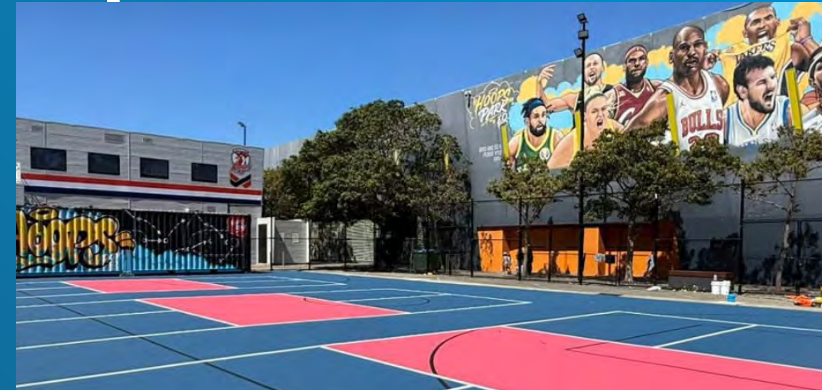
Knoxfield Tennis Club Melbourne