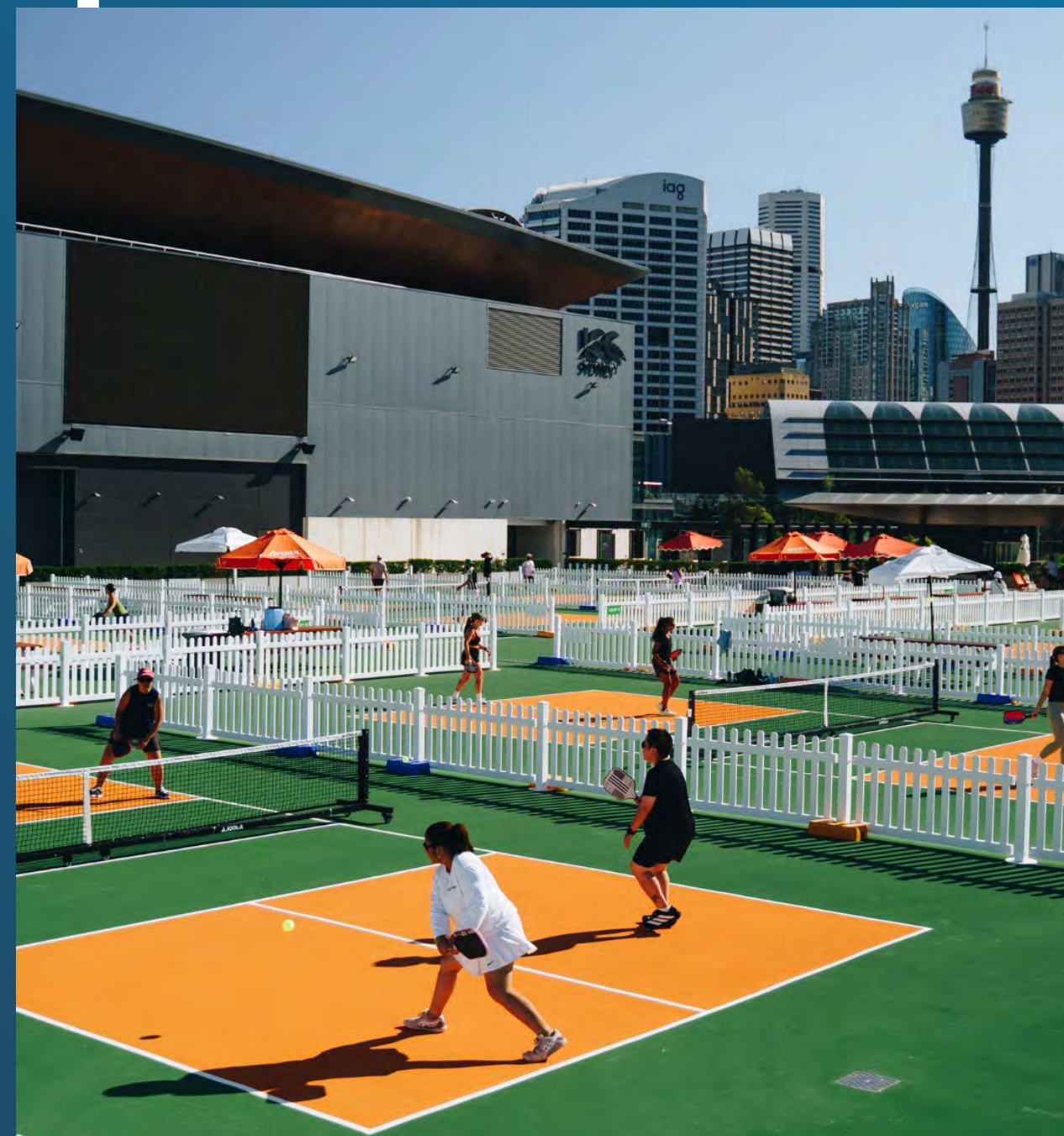
House of Pickle International Convention Centre, Sydney