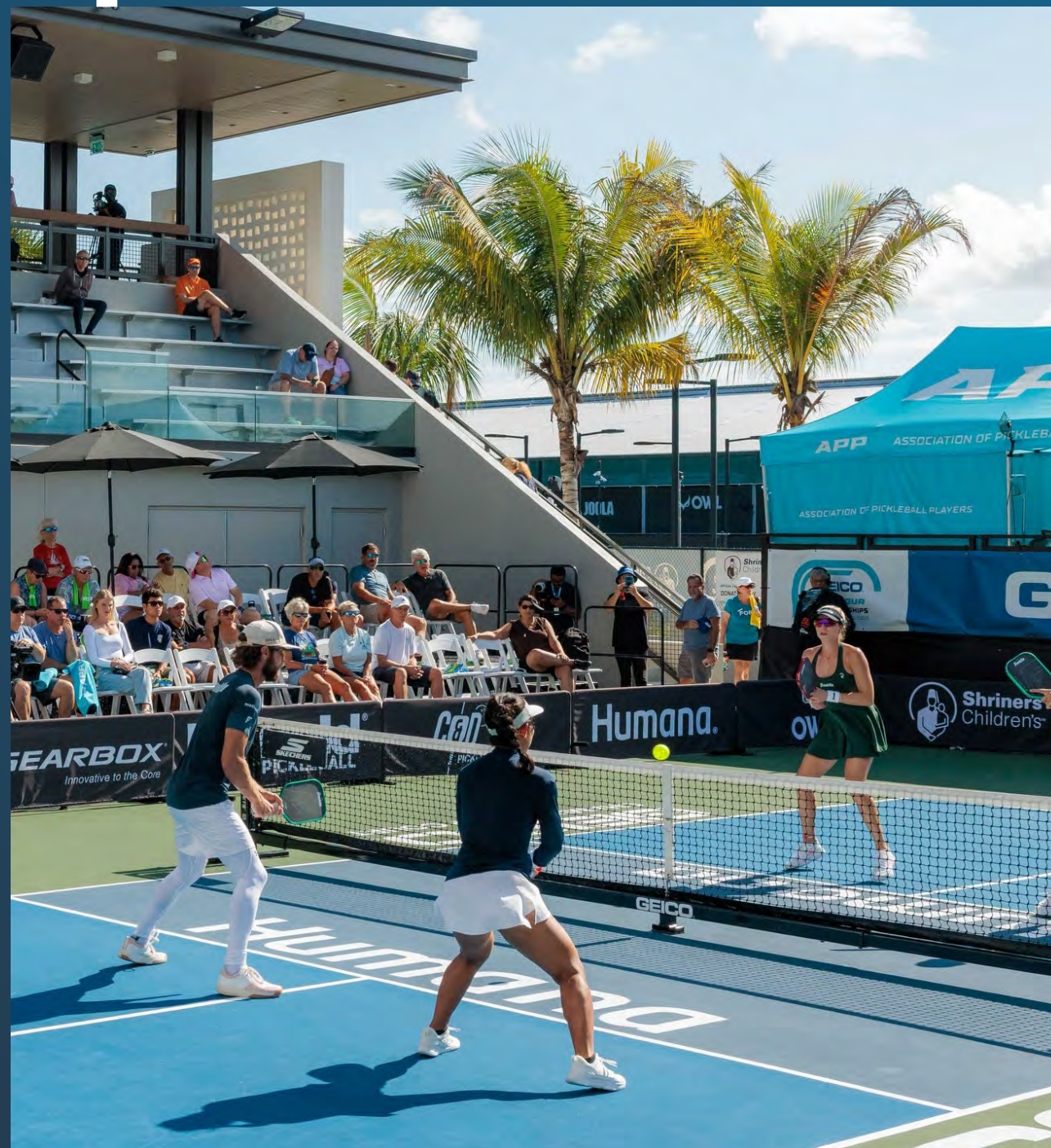
Play the Fort Fort Lauderdale, Florida