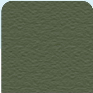
LAYKOLD MEDIUM GREEN