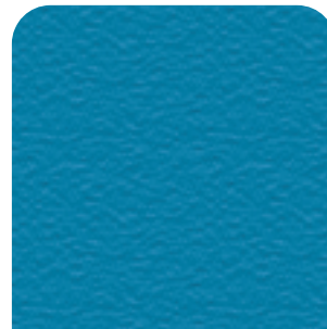
LAYKOLD LIGHT BLUE