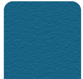
LAYKOLD AUSSIE BLUE