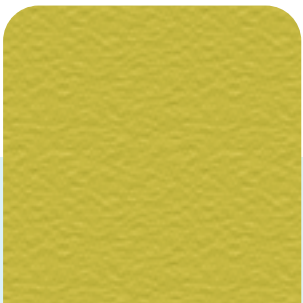
LAYKOLD KEY LIME